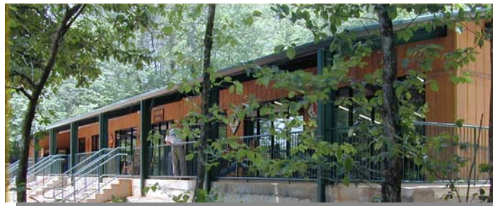
H. Randolph Holder Dining Hall

Need more info? Call the Food Service Office at 706.782.6617 between June 1 st and the close of camp, or the Service Center at 1.800.699.8806.